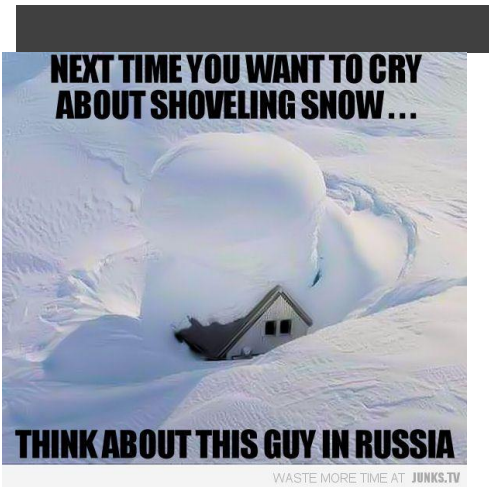
Snow cover 😊